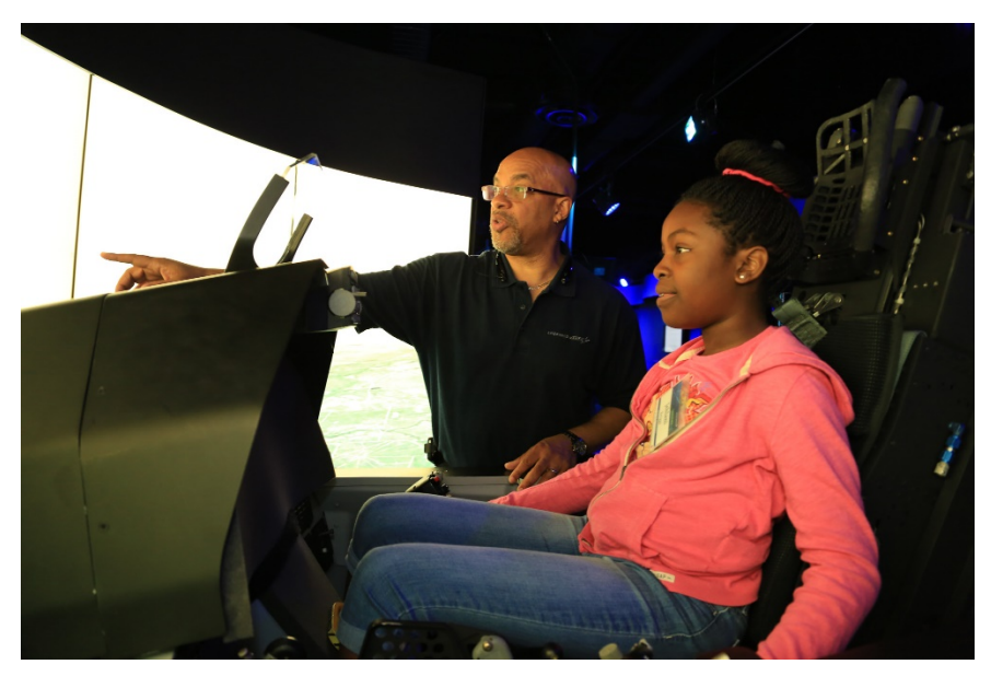
Lockheed Martin Innovation Demonstration Center.