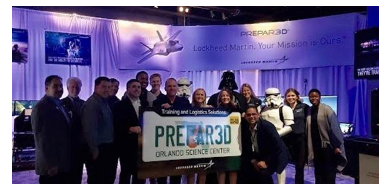
Lockheed Martin Otronicon team at the Orlando Science Center.