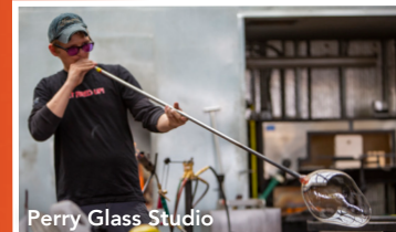
Perry Glass Studio