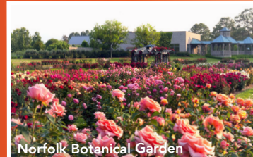
Norfolk Botanical Garden