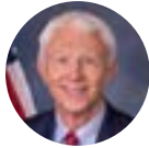
Hon. Jack Bergman 1st District, MI Invited