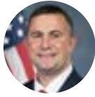
Hon. Darren Soto 9th District, FL