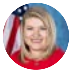
Hon. Kat Cammack 3rd District, FL Invited