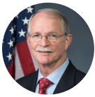
Hon. John Rutherford 5th District, FL