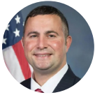
Hon. Darren Soto 9th District, FL