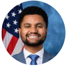
Hon. Maxwell Frost 10th District, FL