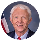
Hon. Jack Bergman 1st District, MI